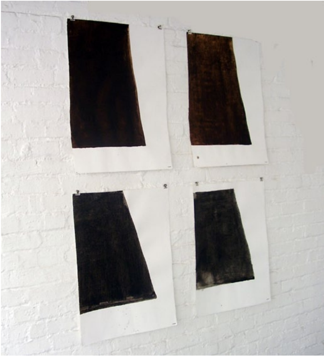
Nirox-Cradle rare dark earth, thornbush charcoal and oxgall ink on paper (Total of 7) 76 x 56cm R14,000.00 (Excl. Vat) per piece. To be sold framed at additional cost to client.